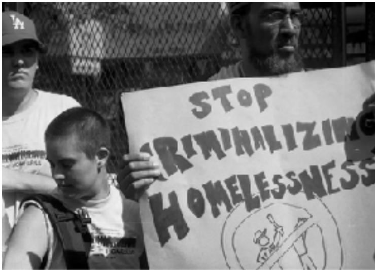
Caption : Stop criminalizing homelessness