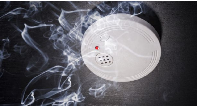
a smoke detector